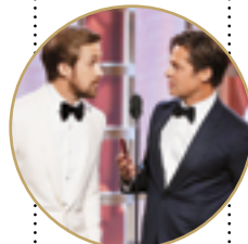
Above from top: Fey at the 2015 awards. Fey co-hosted with friend Amy Poehler in 2013, 2014 and 2015; presenters Ryan Gosling (left) and Pitt. Opposite: Leonardo DiCaprio accepts the award for Best Performance by an Actor in a Motion Picture - Drama last year for work in The Revenant