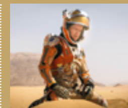
► The Martian